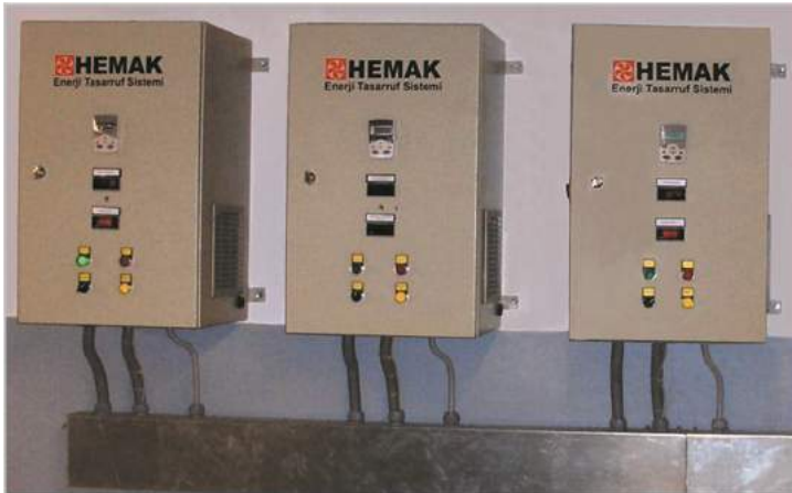
Energy Saving Up To 50% With Inverter Automatic Control And Energy Saving System