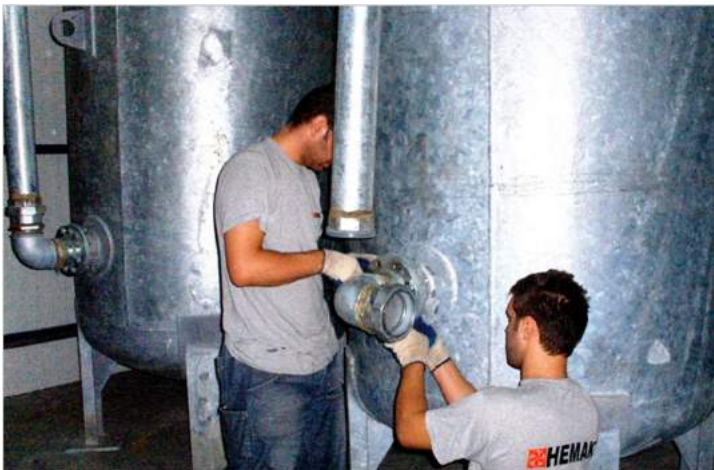
Hot Dip Galvanized And Certified Air Tanks; They Are Rust-Free, Guaranteed Dry Air Tanks.