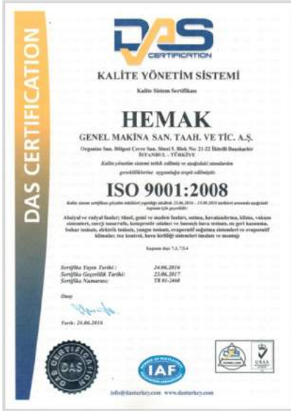
QUALITY MANAGEMENT SYSTEM CERTIFICATE