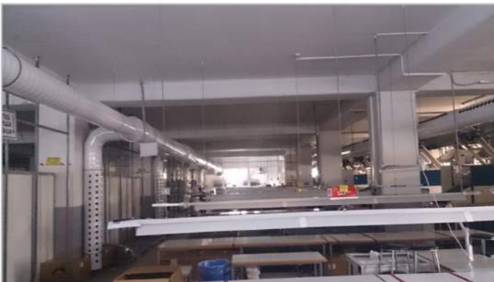
Galvanized Or Electrostatic Powder Coated Air Conditioning Ducts Add Value To Your Factory With Their Aesthetic Appearance.

It is made of self-vented, spiro-safe galvanized pipe, optionally, it is electrostatic powder coated in the desired color. Homogeneous air distribution is provided with hundreds of nozzles opened directly on the pipe developed by our company. It does not require maintenance with its dirt-repellent structure.