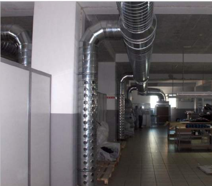
Perfect Comfort And Spaciousness Are Provided With The Indoor Air Conditioning Developed By Hemak.

Therefore, textile air conditioning is a must in large spinning and textile factories.