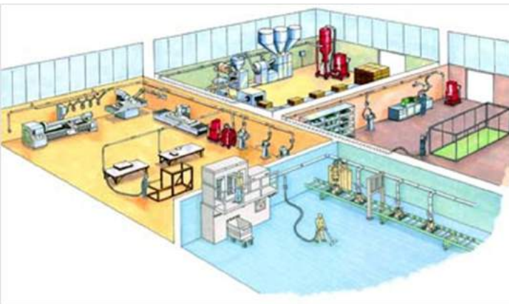
With The Vacuum Central Cleaning System Developed By Hemak, Energy Savings And Absolute Cleaning Are Provided.

With a high vacuum central sweeping system, cleaning of the machine, floor cleaning, cleaning of the dust settled on the pipes and busbars is done, and cleaning with the very expensive compressor air is prevented. In addition, dust flying into the air in the cleaning with compressed air settles on busbars, trays and dead points.