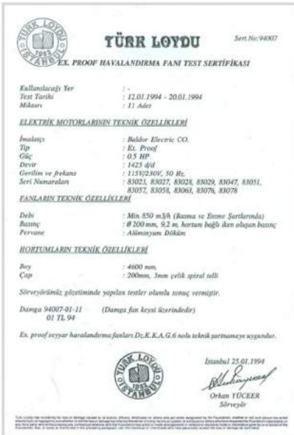
TURKISH LLOYD CERTIFICATE