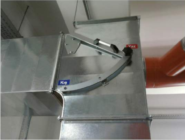
EN-GE Application, Where Factory Heating Is Provided In Winter With The Factory Waste Heat With The Recycling Flap.