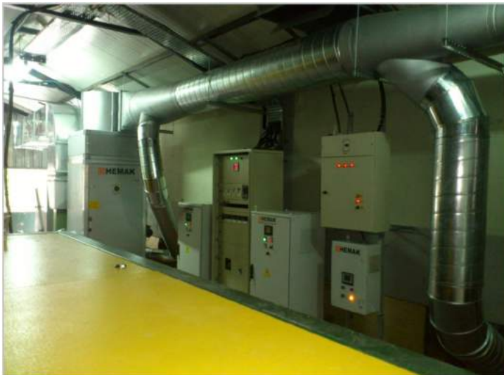
Equipped With Products Of World Famous Brands, Hemak Automation Panel Provides 100% Protection For Your Motors, Does Not Cause Any Malfunction And Does Not Require Maintenance.