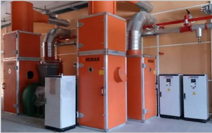
Clean And Tidy Fan&Filter Rooms Where Wastage Made Into Briquettes Take Up Little Space.