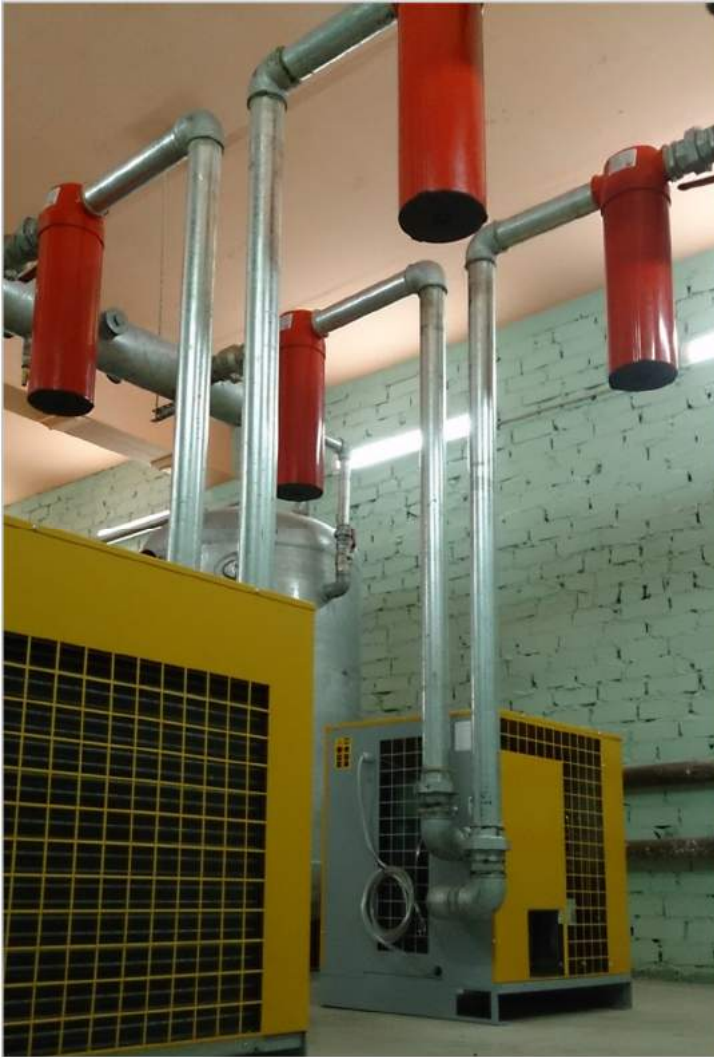
Tidy, Long-Lasting And Low-Maintenance Compressor Rooms With Separator Collectors