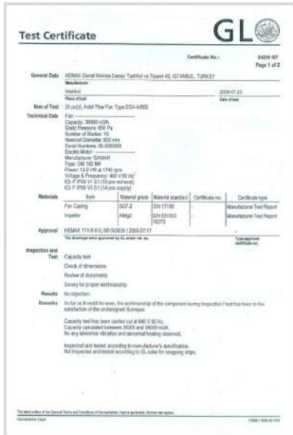
GERMANISCHER LLOYD CERTIFICATE