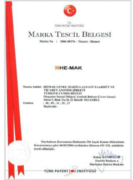
TRADEMARK REGISTRATION CERTIFICATE