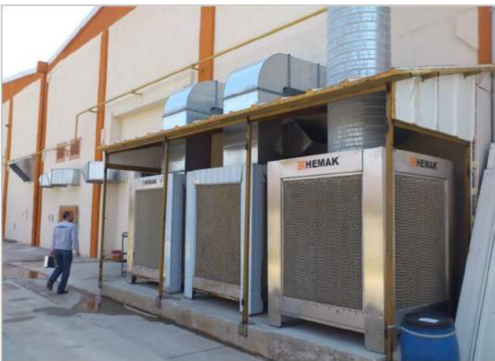
Heating, Ventilating And Air Conditioning System (HVAC)