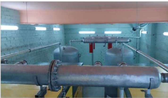
Compressed Air System (CAS)