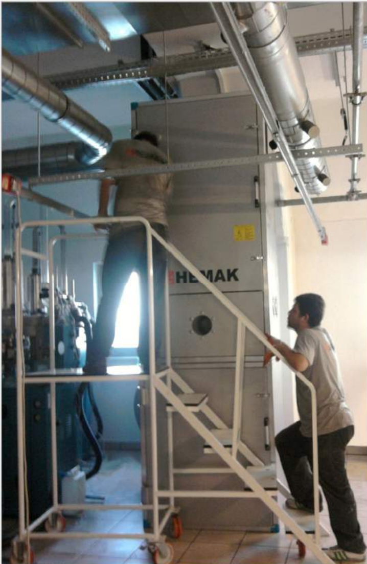
Furniture Looking Devices Add Prestige To Your Factory.