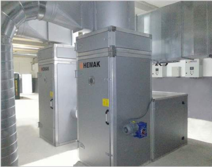
Central Vacuum System (VAS)