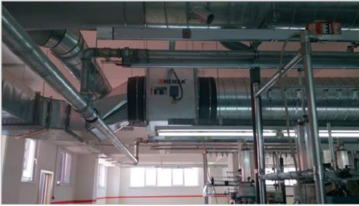
Hemak Ship Type Duct Fans With Duct Look, Decorative, Silent And Maintenance-Free And Self-Vented Air Conditioning Ducts.