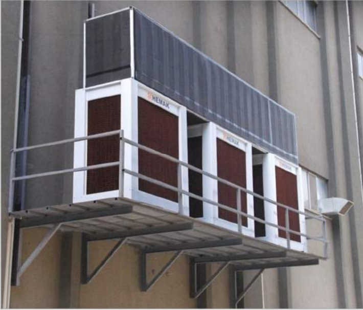
Maximum Comfort Is Achieved By Consuming Minimum Energy With Evaporative Air Conditioners With An All Stainless Body.